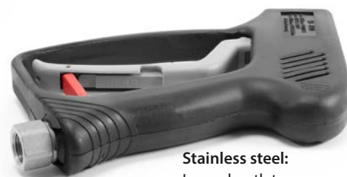
Stainless steel: In- and outlet.

Inner Values: High quality materials for best chemical resistance. R + M Nr. 202 000 054 can also be used for ST-2000 and ST-601.